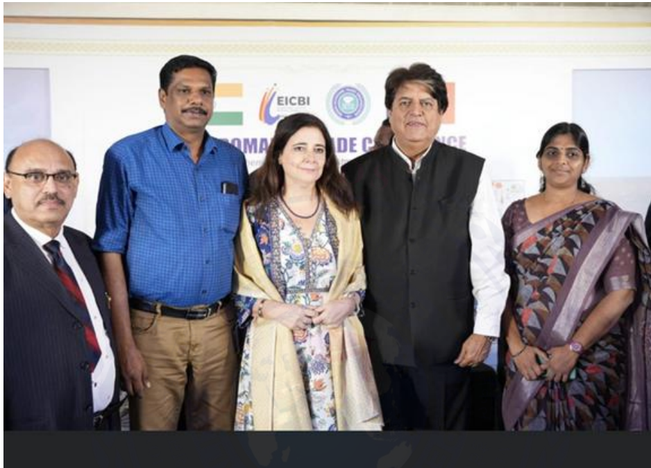
INDIA - ROMANIA TRADE COUNCIL MEETING WITH ROMANIAN AMBASSADOR AND HON. MINISTER - 2023

Our dedication to career empowerment and skill development is strengthened by industry interaction, strategic partnerships, and ongoing learning. In 2023, the following pictures showcase significant events from our journey, such as industry partnerships, expert-led seminars, faculty development programs, educational sessions, and networking gatherings