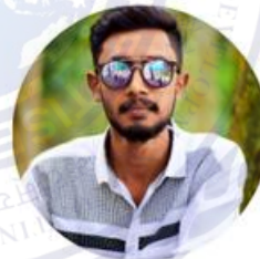
JYOTHISH INTERIOR DESIGNER IQ ARCHITECTURE DESIGN AND CONSTRUCTION COMPANY