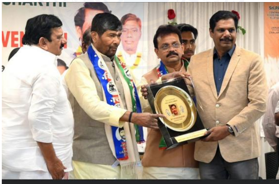
OUR CHAIRMAN IS RECEIVING THE SRI.RAM VILAS PASWAN MEMORIAL BEST INNOVATOR AWARD IN SKILL DEVELOPMENT FROM HON.UNION CABINET MINISTER SRI. PASHUPATHI KUMAR PARAS