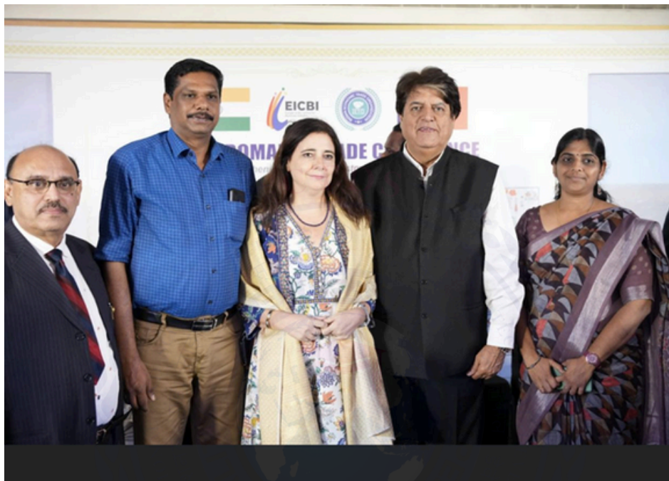
INDIA - ROMANIA TRADE COUNCIL MEETING WITH ROMANIAN AMBASSADOR AND HON. MINISTER - 2023

Our dedication to career empowerment and skill development is strengthened by industry interaction, strategic partnerships, and ongoing learning. In 2023, the following pictures showcase significant events from our journey, such as industry partnerships, expert-led seminars, faculty development programs, educational sessions, and networking gatherings