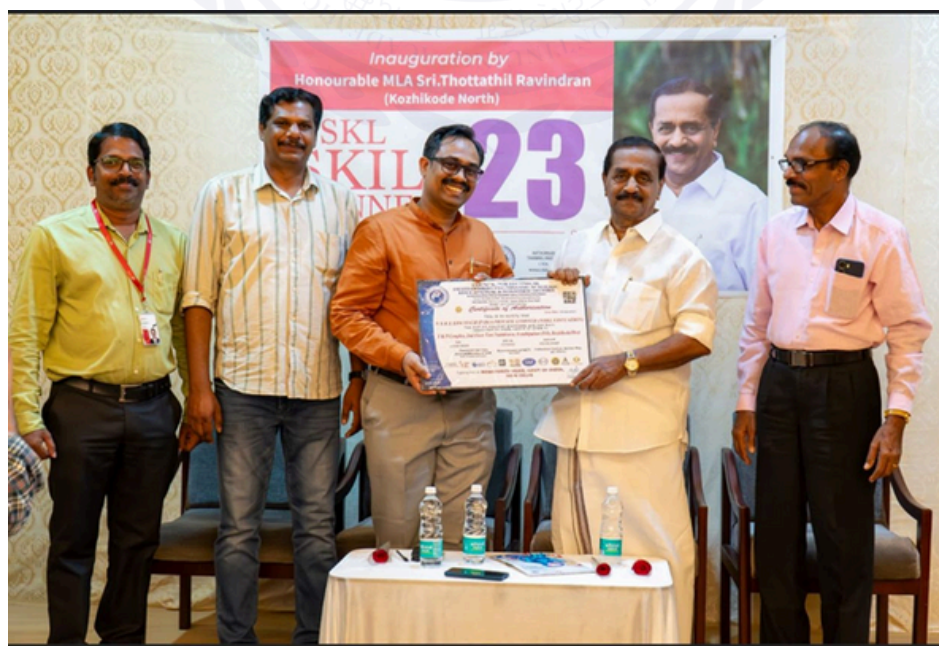
NSKL SKILL CONNECT 2023