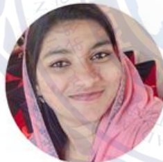
JISANA INTERIOR DESIGNER SHANOOR HOMES