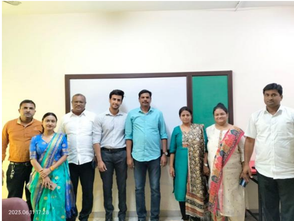
INAUGURATION OF CTDS REGIONAL OFFICE IN GUJARAT