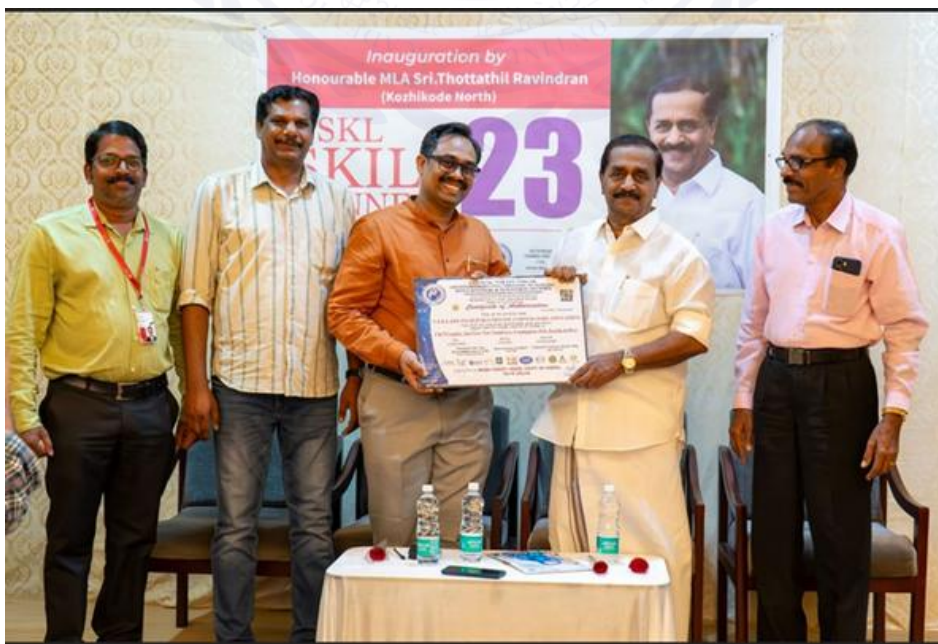
NSKL SKILL CONNECT 2023