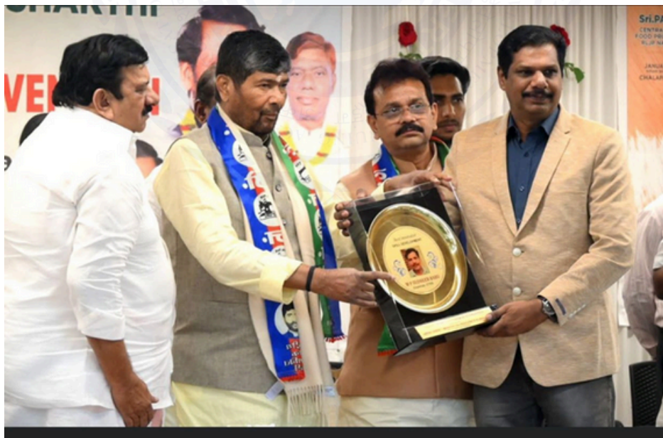
OUR CHAIRMAN IS RECEIVING THE SRI.RAM VILAS PASWAN MEMORIAL BEST INNOVATOR AWARD IN SKILL DEVELOPMENT FROM HON.UNION CABINET MINISTER SRI. PASHUPATHI KUMAR PARAS