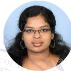
ARCHA CONSTRUCTION MANAGEMENT DESIGNER DAR CONSTRUCTIONS