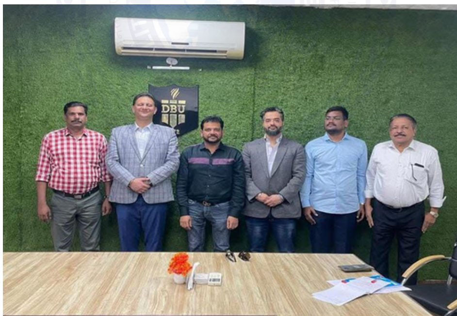
PRODUCTIVE DISCUSSIONS AND COLLABORATION DURING OUR VISIT TO DESH BHAGAT UNIVERSITY, PUNJAB