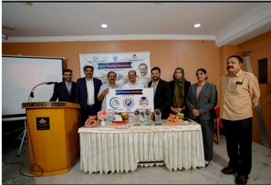
MOU SIGNING CEREMONY OF CTDS, ABLEFOLKS AND FUTURE MINDS EDUCATION- AUG 2023