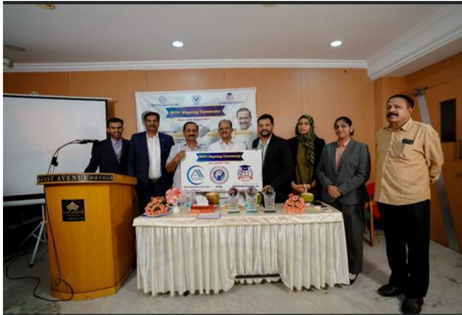
MOU SIGNING CEREMONY OF CTDS, ABLEFOLKS AND FUTURE MINDS EDUCATION- AUG 2023