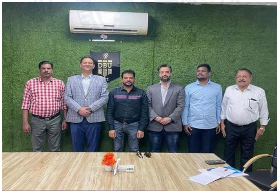
PRODUCTIVE DISCUSSIONS AND COLLABORATION DURING OUR VISIT TO DESH BHAGAT UNIVERSITY, PUNJAB