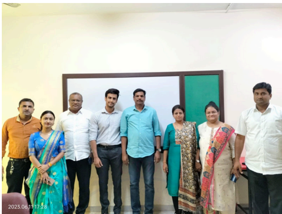
INAUGURATION OF CTDS REGIONAL OFFICE IN GUJARAT