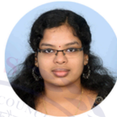
ARCHA CONSTRUCTION MANAGEMENT DESIGNER DAR CONSTRUCTIONS