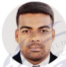
JIMSON DIGITAL COMMUNICATION EXECUTIVE MSC CRUISE LINE