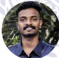
PRINCE JOS INTERIOR DESIGNER FEZA INTERIORS