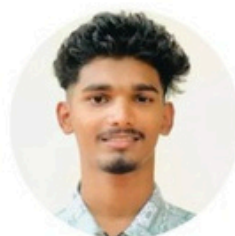
SINAS FRIENDS BAG