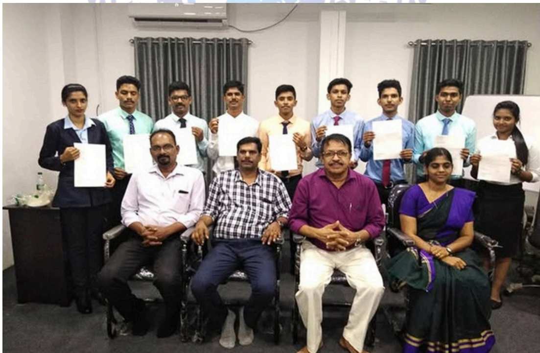
SHARING THE WONDERFUL MOMENTS WITH OUR AVIATION STUDENTS WHO WON THE PLACEMENT IN MUMBAI AIRPORT.