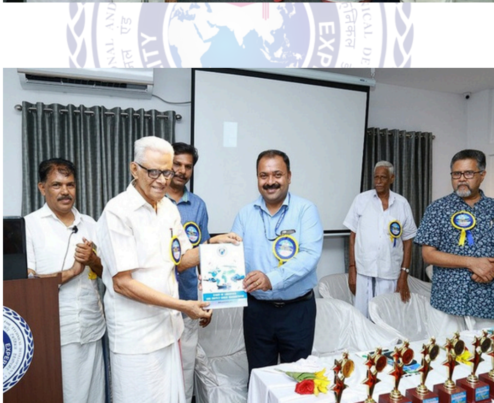
BOOK RELEASE & FELICITATION AT CTDS AUDITORIUM