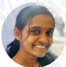
AVANI MAX FOOT LOCKER